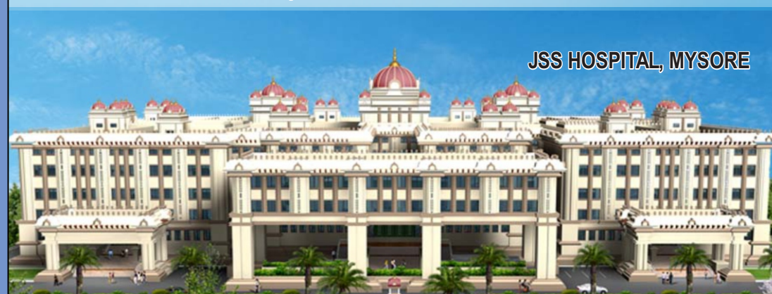
JSS HOSPITAL, MYSORE

M. G. Road, Mysore, Karnataka, India - 570004