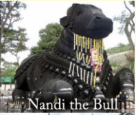
Nandi the Bull