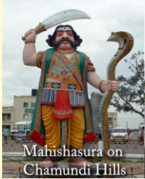
Mahishasura on Chamundi Hills