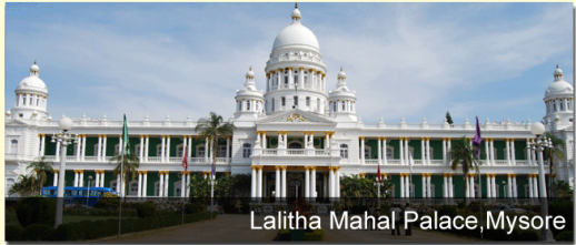
Lalitha Mahal Palace, Mysore